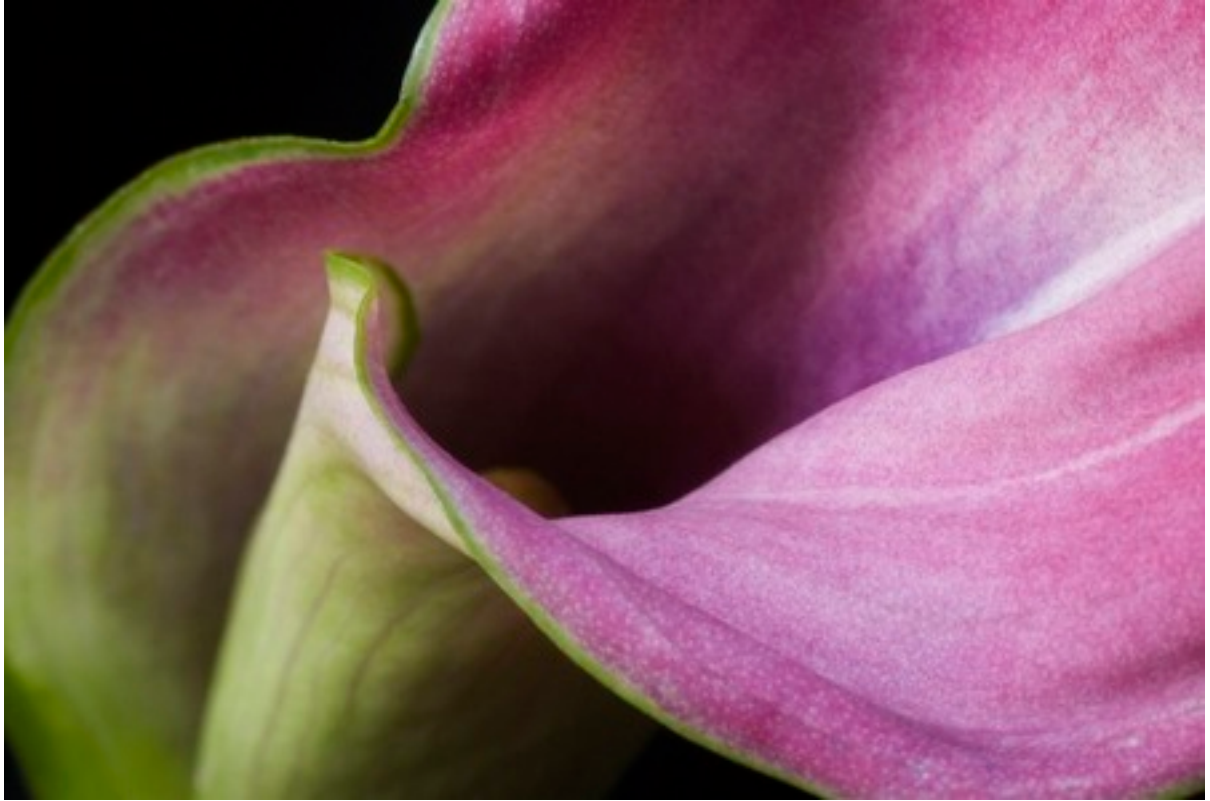
calla la la la by Julie Scholz

Macro photography is a beautiful way to take what is often normal subject matter, and make it extraordinary, simply by offering a new perspective. Its often these types of photos that turn out the best. When we are provided a glimpse of something we might not otherwise pay much attention to is all of a sudden (in effect) shoved in our face, we cannot help but stop and take notice.