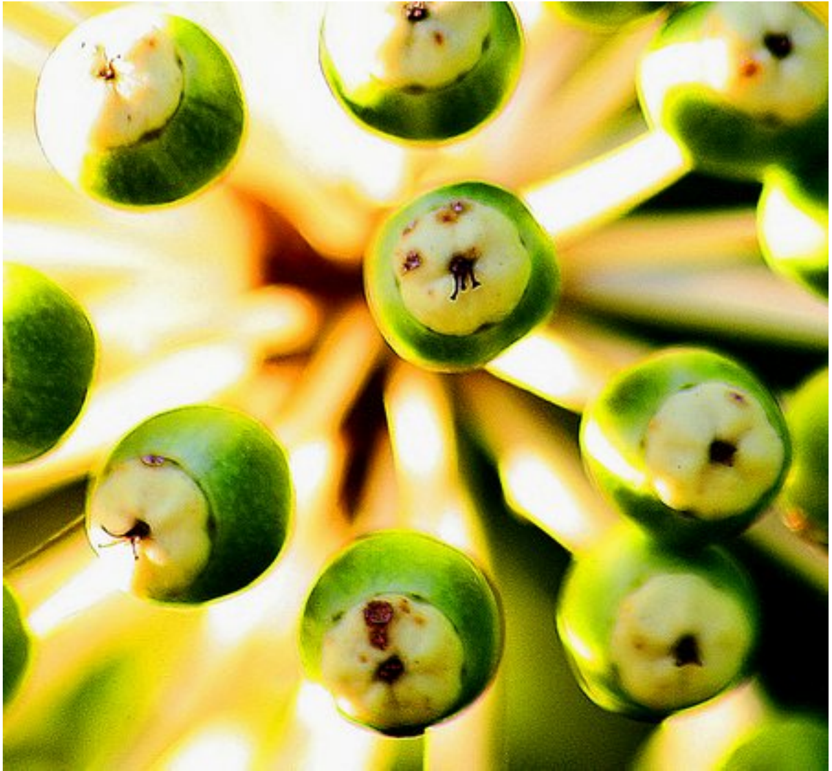
Macro plant