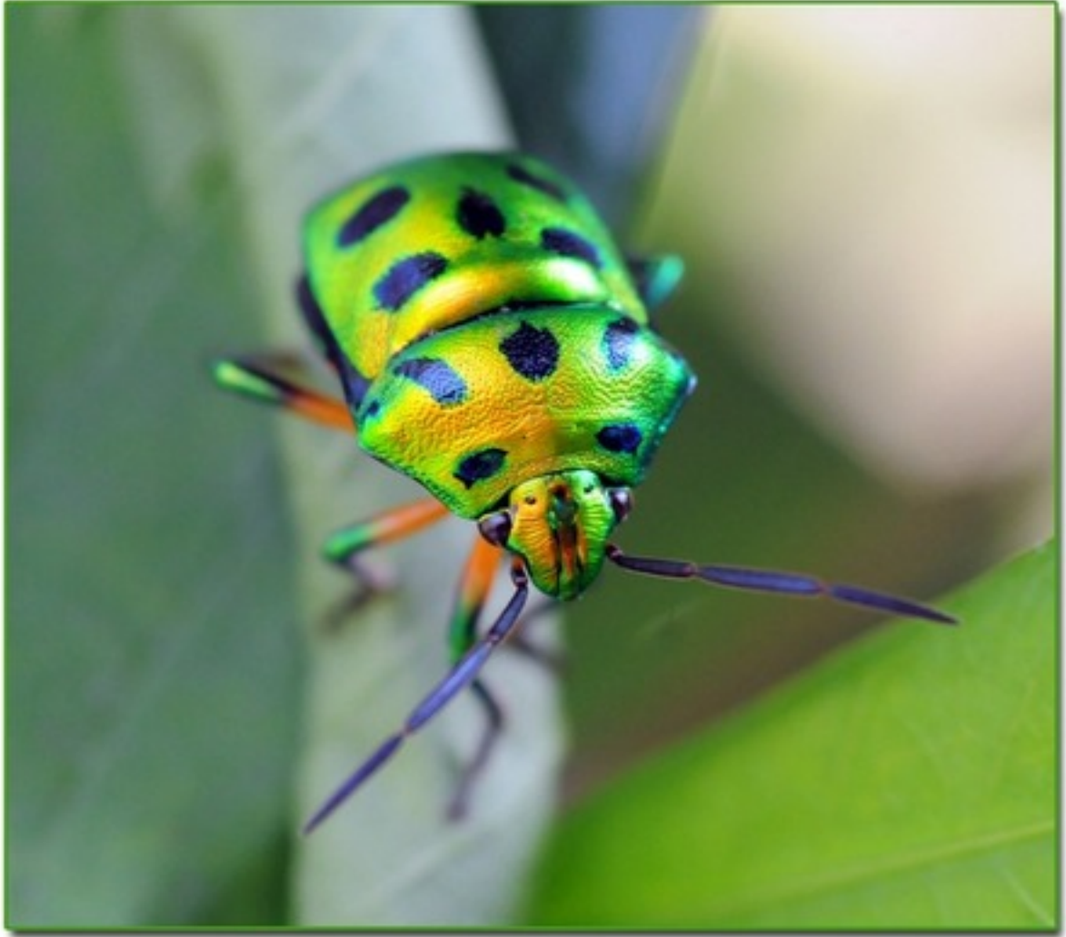
Macro Bug by Murlon123