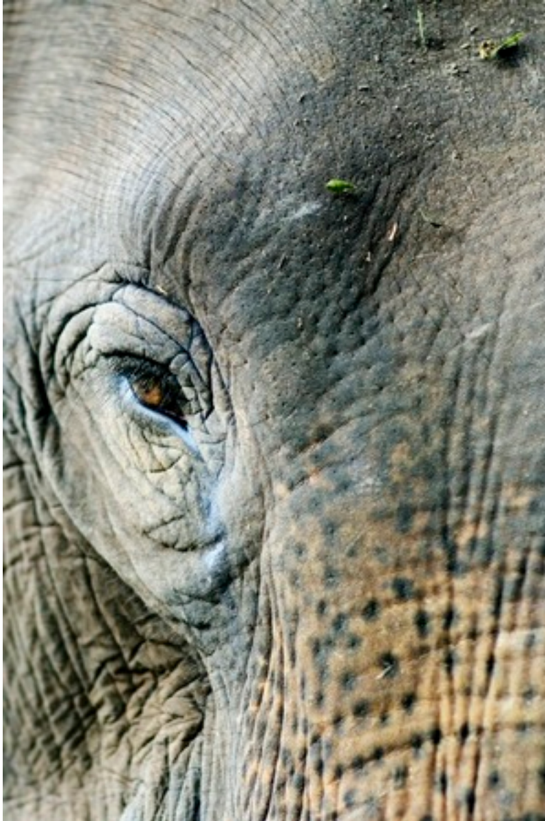
Thai Elephant