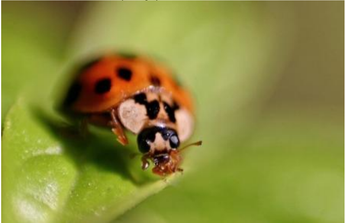
ladybird extreme closeup