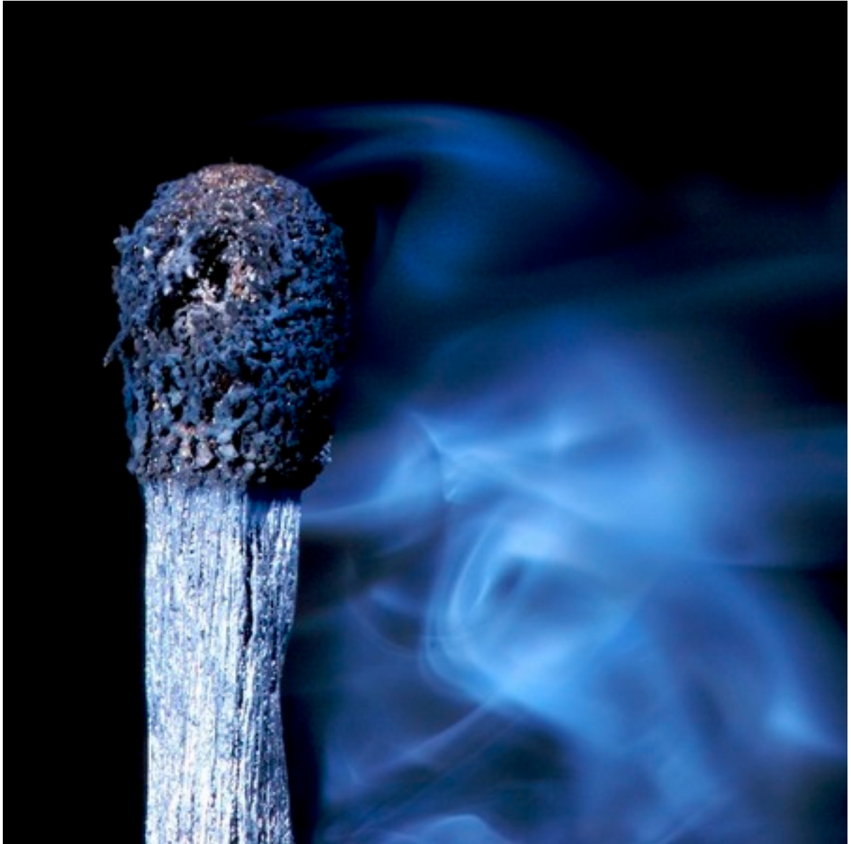
Blue Smoke by David Lindes