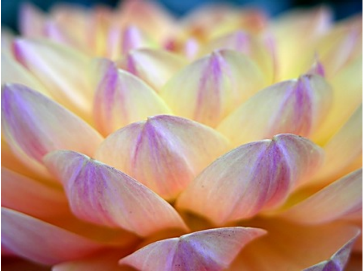
Flower: Dahlia "Inner Glow" by Soulful Photos