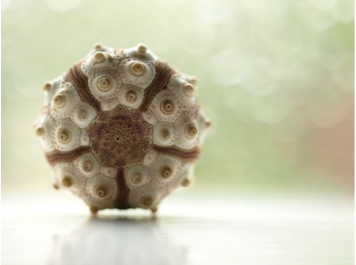
Spudnik Sea Urchin... by Machel Spence