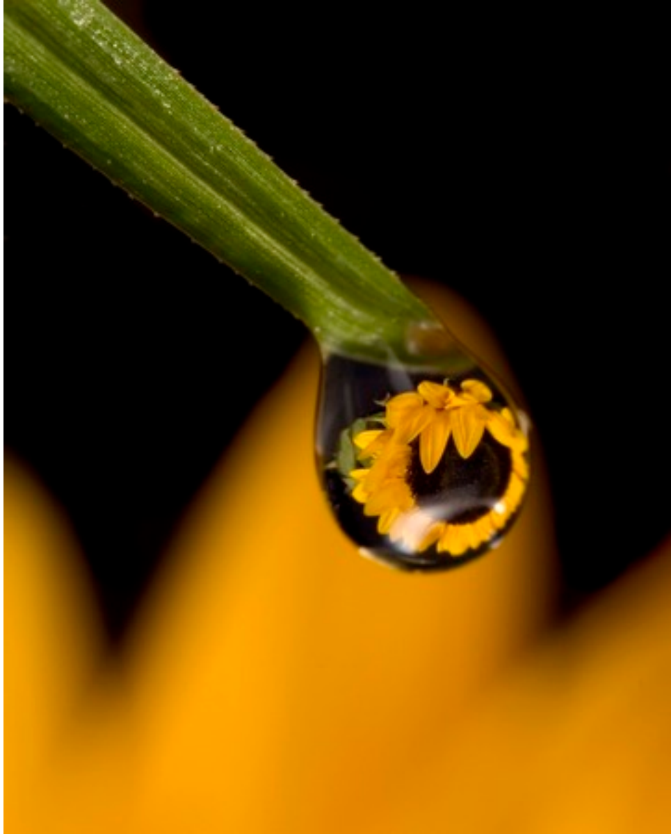
Macro Drop