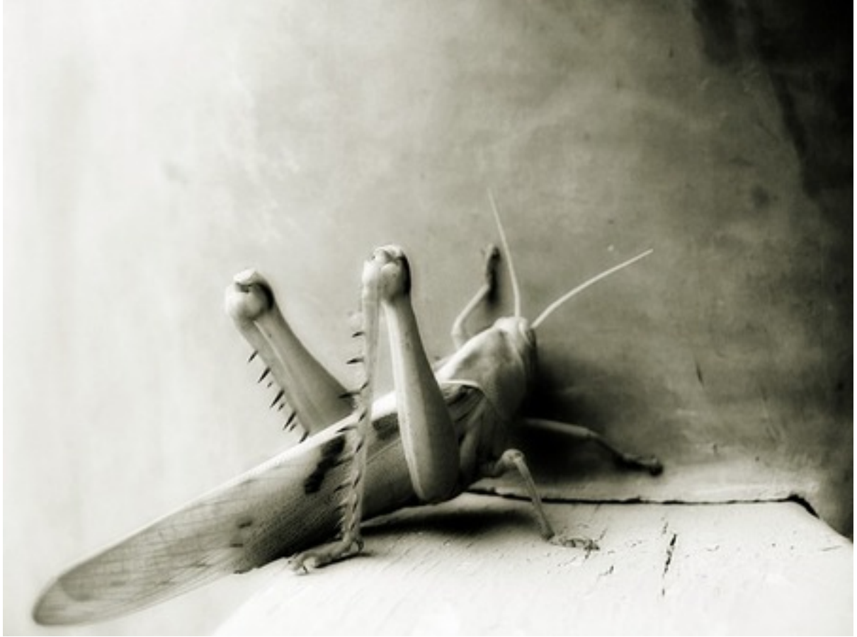
Grasshopper Green by Samarth Bhasin