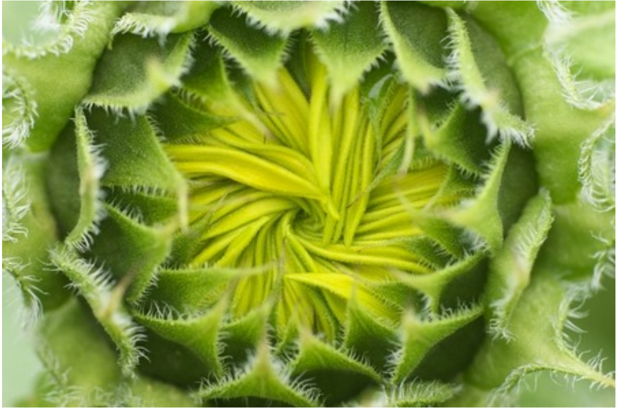
Sunflower