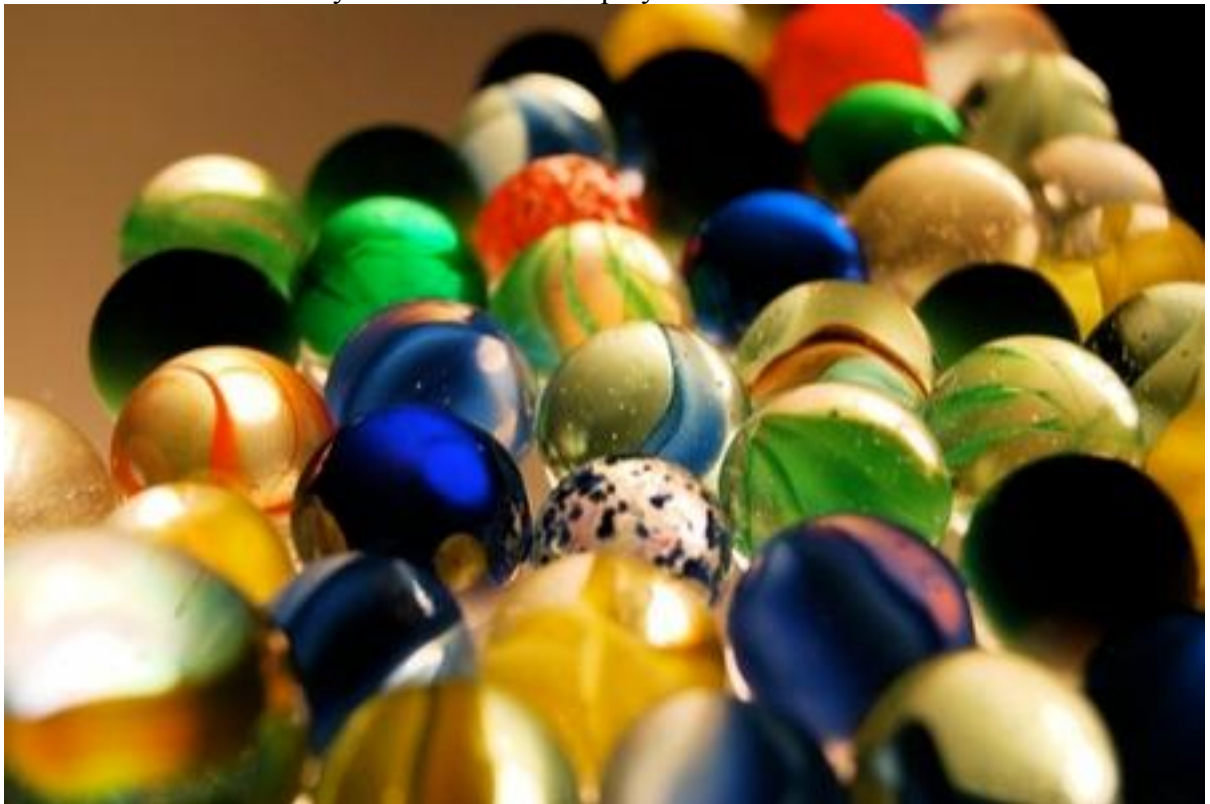
Old marbles by Rick Takagi