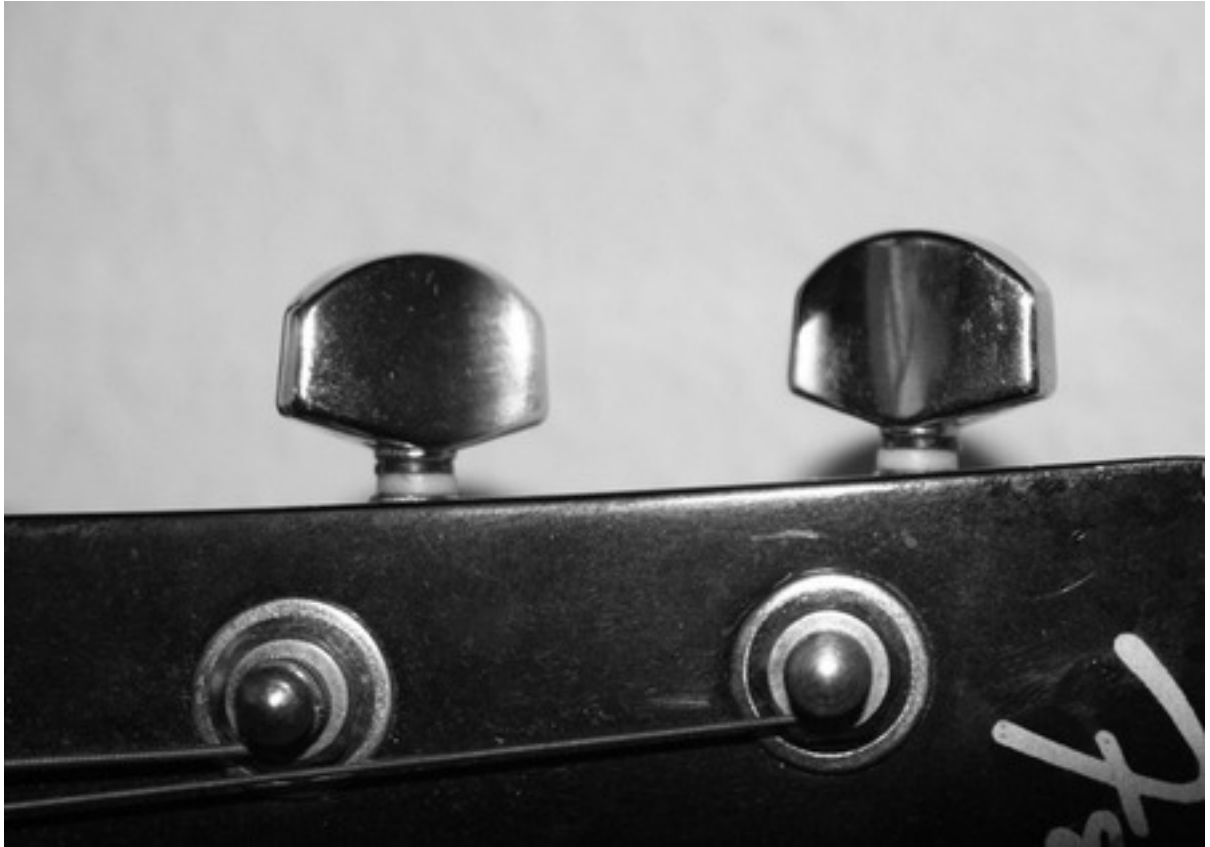
Left-twist by VIC Dessau